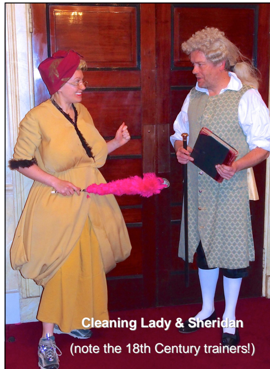
Theatre Royal, Drury Lane—see p.13