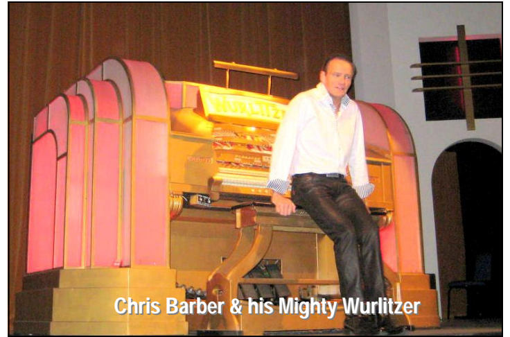
Brentford Music Museum—see p.12