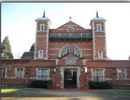
Harrow Arts Centre